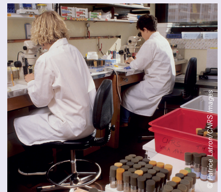
Research on Drosophila mutations.

As a time to work and think innovatively, studying for a PhD provides candidates with real professional experience, acquired in research and from research. The development of international joint PhD supervision programmes ( cotutelles internationales de thèse ) – hereafter, ‘PhD cotutelles’ – is part of the internationalization drive undertaken by French Higher Education Institutions. This type of international partnership is based on bilateral scientific collaboration, whereby the expertise of two supervisors enables the PhD student to carry out original research. In the French context, PhD cotutelles are a specific form of joint PhD degree programmes, governed by an agreement that covers all the aspects of the PhD programme, from registration to defence, and the award of one (i.e. a joint PhD degree), or two parchments of equal value (i.e. a double PhD degree).