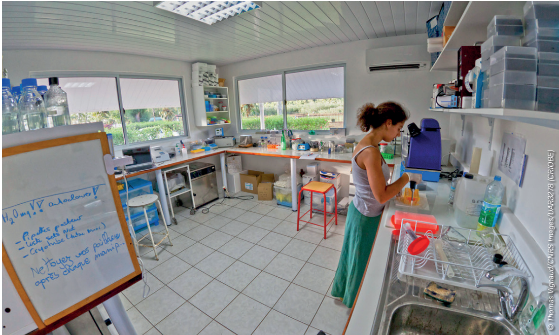
Sample preparation in a laboratory at the Centre d'études insulaires, Moorea, French Polynesia.