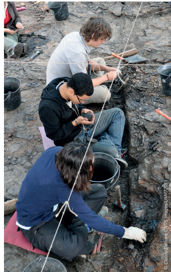
Systematic excavations at the Permian site of the Autun Basin, near the commune of Muse, Saône-et-Loire.